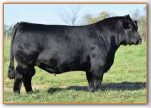
CISL DAUNTLESS 6257D ET