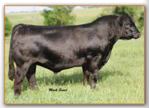
YARDLEY HIGH REGARD W242