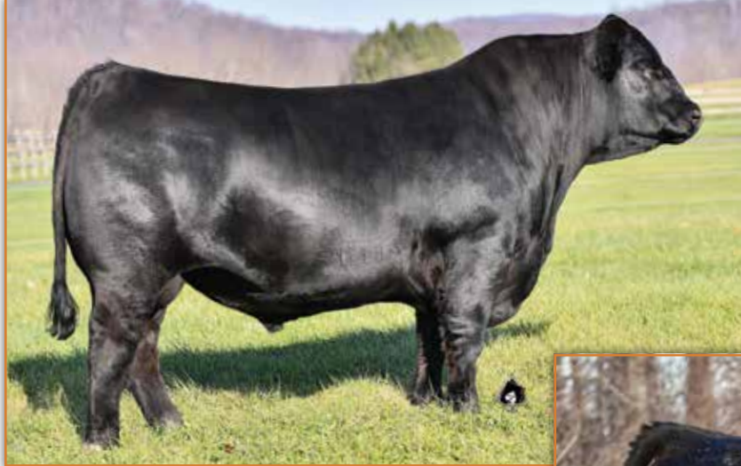
COLE GENESIS 96G • SIRE OF LOT 26