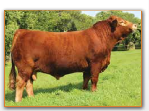
WULFS FIFTY T804F