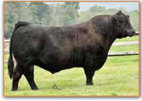
CJSL CREED 5042C