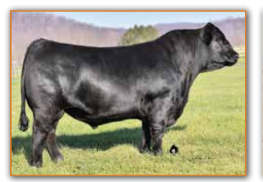
COLE GENESIS 86G