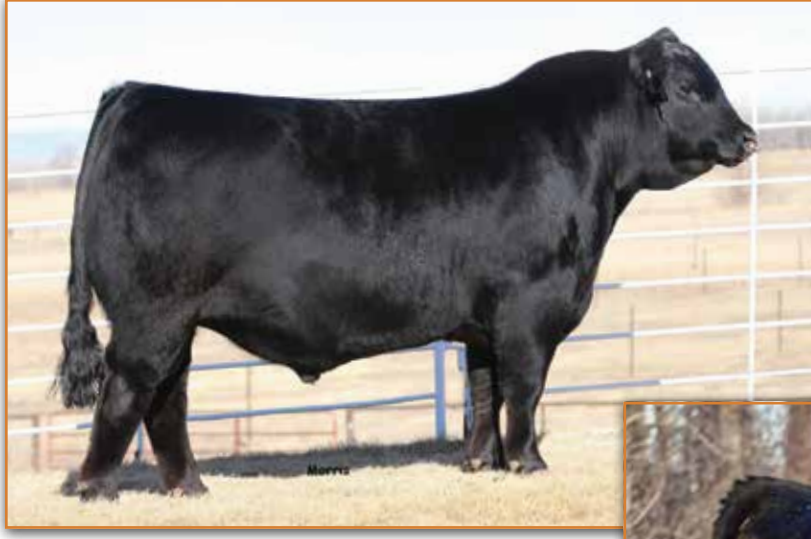
MAGS CABLE • SIRE OF LOT 12