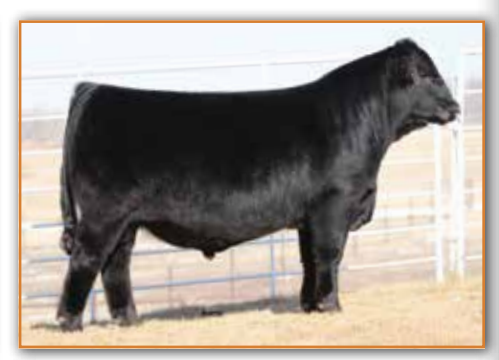
MAGS FIRESTONE 218F