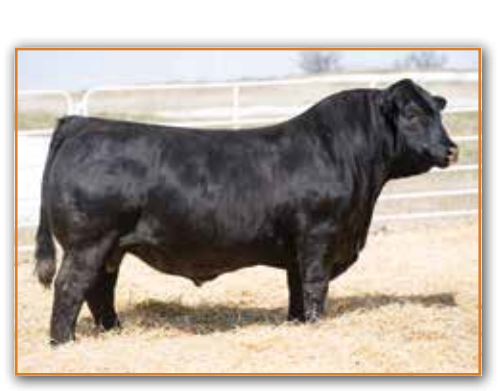
CJSL DATA BANK 6124D ET